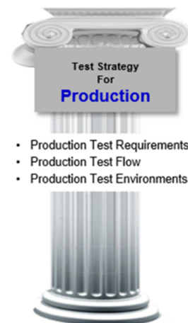
Figure 5. Production Test Strategy Pillar Artifacts.

the product is in this stage for many years and the most program costs are incurred if assembly and test are not optimized [14]. This pillar starts with the product being used for production verification and validation of the assembly and testing processes and continues to mature as it enters full rate production. If the production test strategy is not thought through early in the program, costs will increase as a result of performing too many tests, not decreasing test complexity at higher levels of assembly, lack of test requirement funneling based on environmental exposure, design verification testing being performed in production and poor First Pass Yield due to a) poor design margins, b) poor test equipment, c) poor design, d) poor test limits.