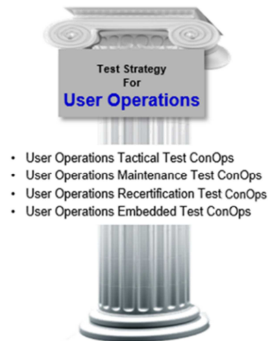
Figure 3. User Operations Test Strategy Pillar Artifacts.

be powered continuously with BIT being run periodically in an extremely hot environment which dictates that the product would need to be cooled while operating. These type of requirements need to be understood when developing the product and how it will be used in testing when verifying that the product meets the customer requirements.