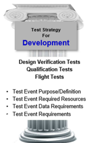
Figure 4. Development Test Strategy Pillar Artifacts.

verifies design against requirements, establishes margin over environments, and validates that the product meets customer's needs. It also defines detailed product integration, verification and validation activities which include qualification tests, flight tests and reliability growth testing. This is part of the process where the product design is maturing and evaluation testing occurs. In this phase, cost drivers lead to poor performance and low reliability including late failures in test program due to immature technology; interface problems accounting for unreliable margin performance and measurement errors; and poor testability for one-shot items [12]. Issues in any one of these areas results in the product not meeting the customer's needs. Typical questions asked when defining the development test strategy pillar include: What type of testing will be required to gain access to a government range, facility or platform? What testing will be completed to verify and validate the product design meets all the requirements? What level of assembly are tests conducted? How many system level tests will be needed? Can simulations or analyses be used to verify requirements instead of performing a costly test? Are requirements verifiable by test within the current capabilities? Are there any special tests or analyses that need to be performed post qualification to verify the requirements have been met [13]?